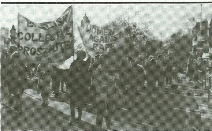
March against the Police Bill, 21 January 1984

I don't understand why the court wasn't willing to give the Black girl time to pay. They gave me 12 days to pay and another white girl 28 days to pay. This looks like discrimination against the Black women that work the beat, as if things aren't hard enough already.