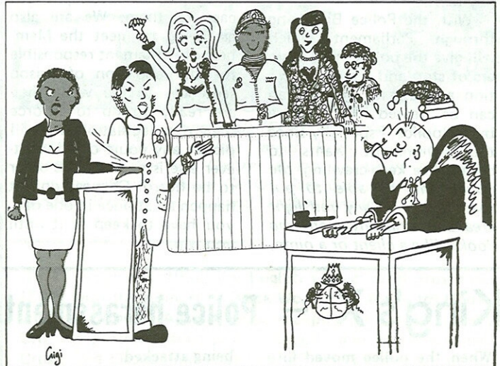
Hookers and peace women challenge the courts

What they do not say is what women are doing instead of prostitution. Some of us have been forced back to factory jobs at £60 a week,