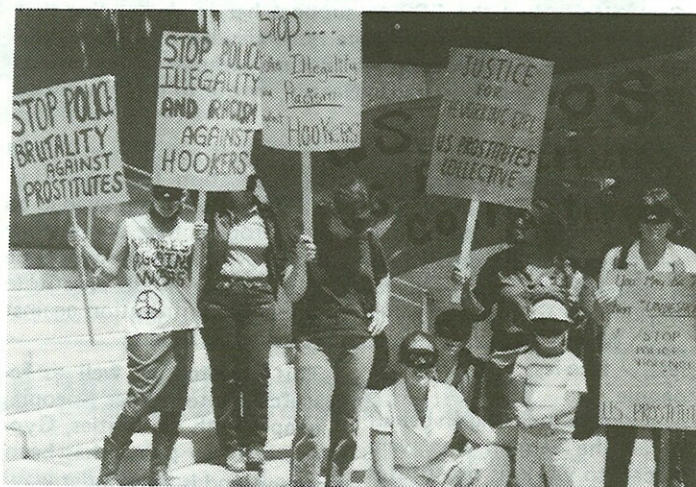
On the steps of the Hall of "Injustice"

US PROS P.O. Box 14512 San Francisco Ca. 94114 Tel. (415) 5589628