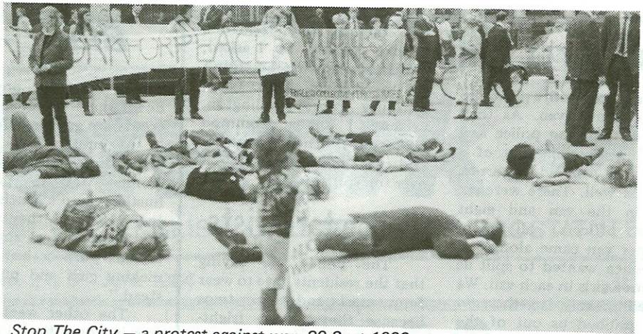
Stop The City — a protest against war, 29 Sept 1983.

However we fight for survival there are always a few who are ready to call the police on prostitutes, Black people, peace demonstrators, pickets, punks, junkies, gays, lesbians and other so-called freaks. Although these residents are a minority they have the ear of central and often local government. But we have 'our' residents too. Read on . . .