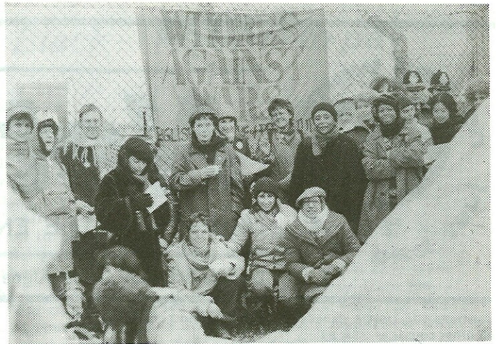
Greenham Common, 11 Dec 1983

We have asked the Magistrates' Association and Sheffield Magistrates to receive a delegation who can put our case to them. We are also arranging to meet the Members of Parliament responsible for the abolition of prison sentences to see what they are ready to do to enforce their own legislation. We will picket any court or do whatever else is necessary in order to be heard. Changes do not happen all at once in one day, you have to keep at it until you win.